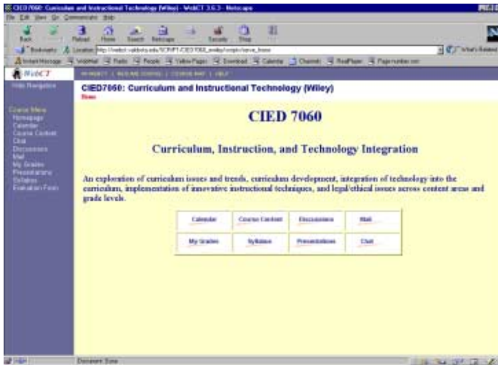
Figure 2: Screenshot of Lesson page for CIED 7060 course built using WebCT 3.6 Standard edition